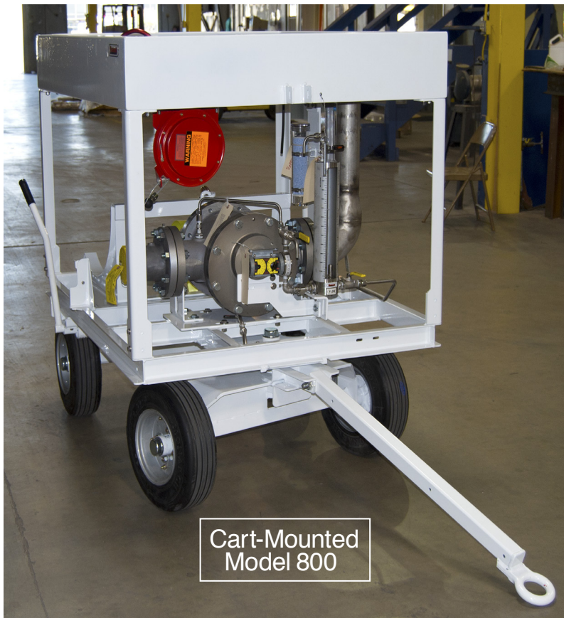
Cart-Mounted Model 800